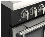
F4EDF366CS1-MB MATTE BLACK RAL 9004