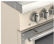
F4EDF366CS1-MI MATTE IVORY RAL 1015