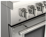
F4EDF366CS1-SS STAINLESS STEEL