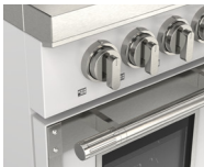
F4EDF366CS1-MW MATTE WHITE RAL 9016