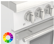
F4EDF366CS1-RAL RAL CODE