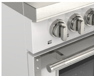
F4EDF366CS1-WH GLOSS WHITE RAL 9016